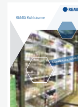
Cold storage rooms