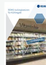
Insulating glass doors